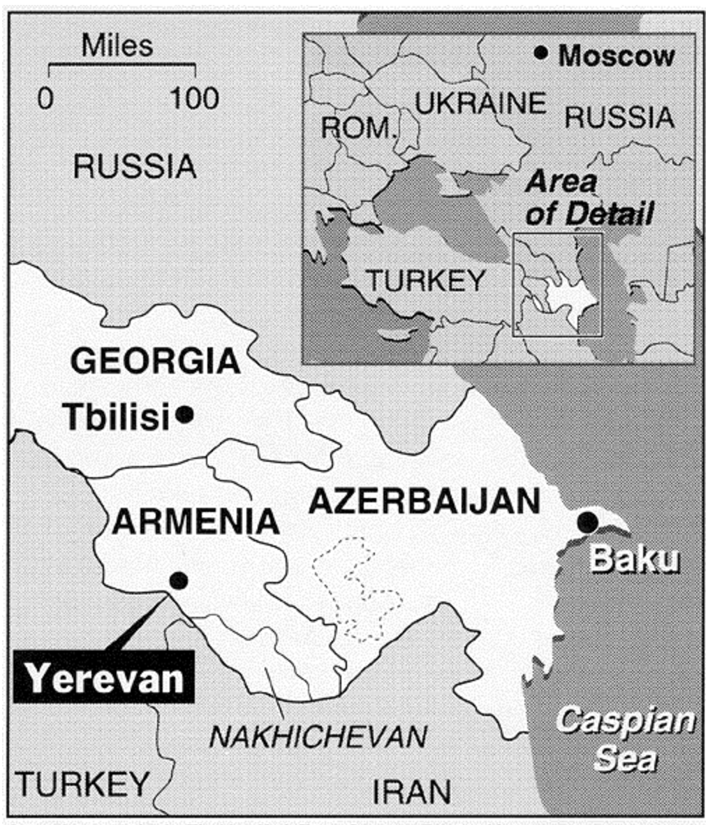
Copyright © 1992/93 by The New York Times Company. Reprinted by permission.