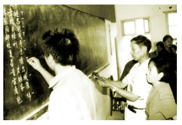
[Vote counting in Yangji]

Eligible voters recommended their choices for preliminary candidates by casting one vote per position by secret ballot. After polls closed, the ballots were tallied on the spot, and an election official publicly announced the results. 7,727 people (81.6%) out of the 9,469 people eligible to vote participated in the nomination process.