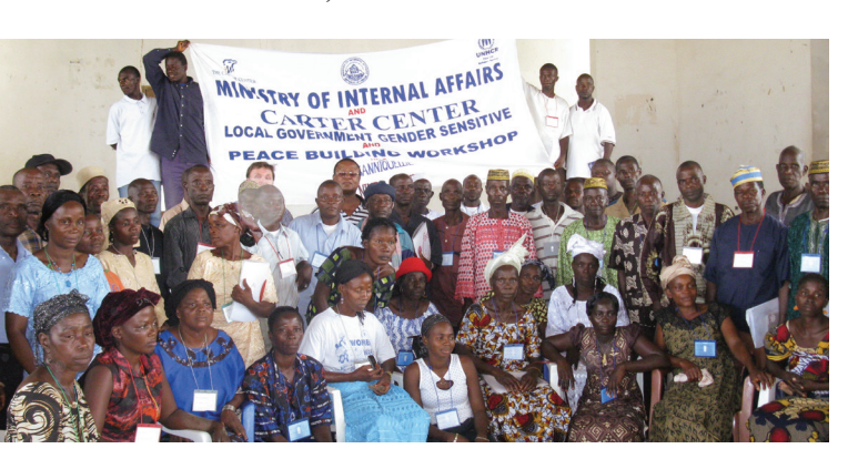
Council, and the Ministry of Gender, The Carter Center held workshops on strengthening rule of law and expanding women's role in governance.