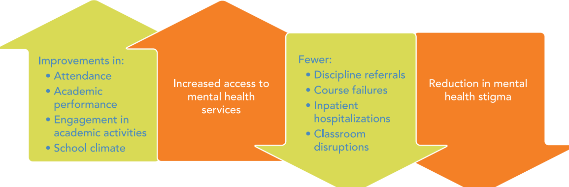
Figure 1 – Positive Outcomes Associated With SBMH Programs

SBMH programs lead to a variety of positive outcomes for students, their families, and schools. 9-20 Examples include those in Figure 1.